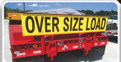
Oversize Load Sign