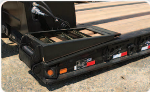
Spring Loaded Front Flip Ramps