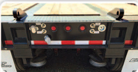
Complete Set Up for Future Axle