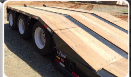
Wood Filled Rear Riser and Trunnion Area