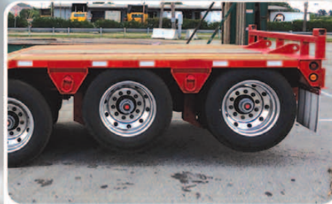
Lift 2nd and 3rd Axles