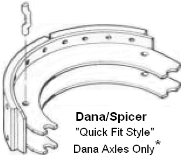
Dana/Spicer "Quick Fit Style" Dana Axles Only *

Limited use 1993 - 94 Obsolete Replace with "PQ"