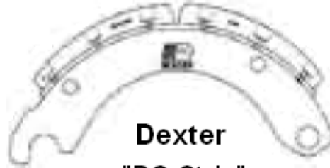
Dexter "PQ Style"

10-12 Ton Up to 1993 20-25 Ton Up to 1993