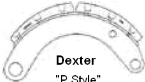
Dexter "P Style"

10-12 Ton Up to 1993 20-25 Ton Up to 1993